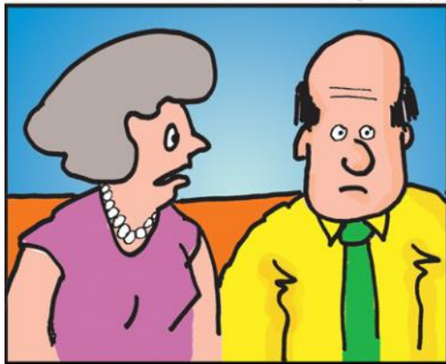
Church of the Covered Dish by Thom Tapp

“Can you remember way back when sin was a BAD thing?”