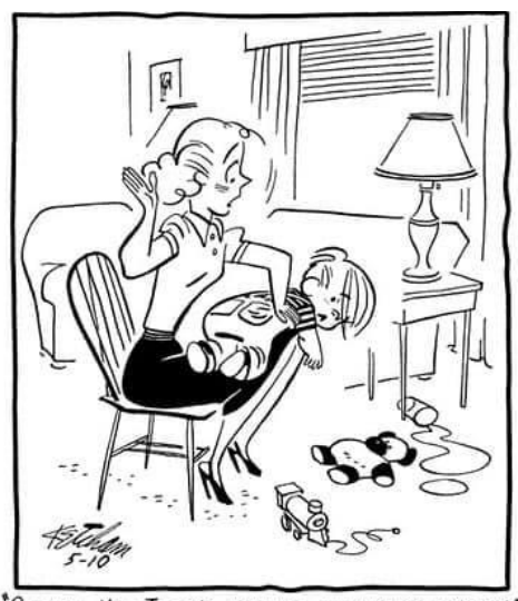
*CAREFUL, MOM. THERE'S A SNAKE IN MY BACK POCKET."