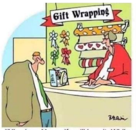
"Nice iron. Your wife will love it. While I wrap it, you might want to go over to sporting goods and pick out a helmet."