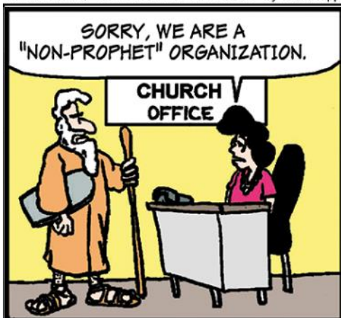
CHURCH OF THE COVERED DISH by Thom Tapp